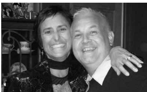
Chili Bowl February 2011