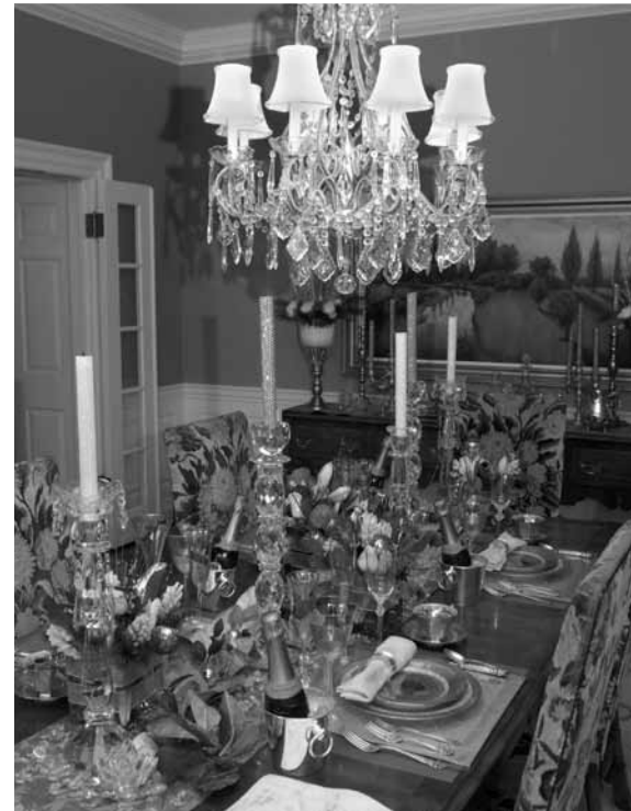
Holiday Housewalk & Market December 2010