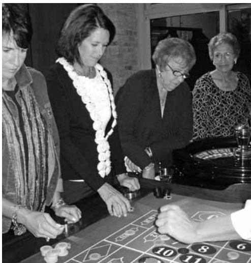
Rollin' on the River September 2010